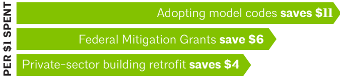
Natural Hazard Mitigation Saves: 2019 Report

Using AIA principles, architects can help the nation's leaders pinpoint the right codes and grants to reduce costs and protect the environment.